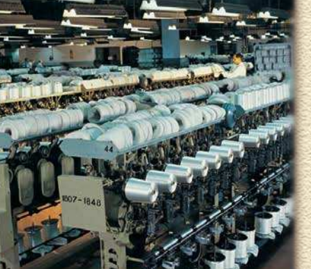
Manufacturing plants use Thern throughout for lifting, moving and pulling.

Construction sites have many uses for portable Thern winches and cranes.